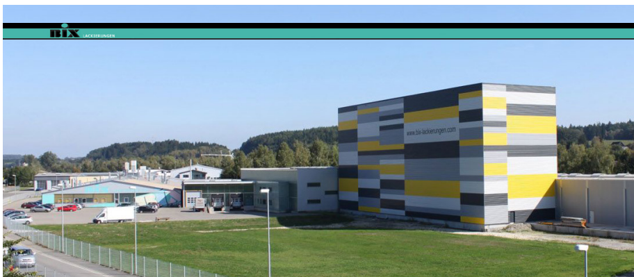
› Bix Lackierungen in Meßkirch