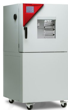
› MKF 56 dynamic climate chamber