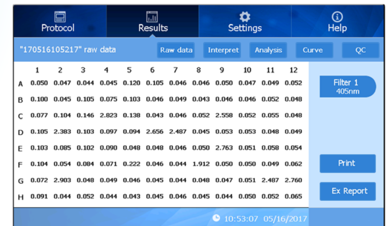
Reading Results Screen

Measurement data is available immediately on the screen after a reading, as well as interpretations, calculated analysis and curve fittings.