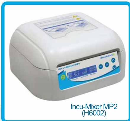
Incu-Mixer MP2 (H6002)