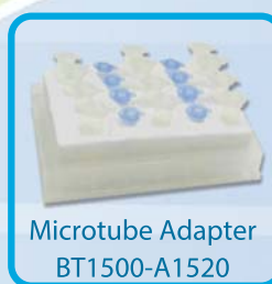
Microtube Adapter BT1500-A1520

Designed for application flexibility, the Incu-Mixer series is available in two, and four-plate capacities. The four-plate model features an increased chamber height for accepting plates up to 46mm high. Independent time, temperature and speed controls allow the mixer to function as 3 machines in one; a multi-plate incubator, vortexer, or a combination of the two. The Incu-Mixer MP series is ideal for a wide variety of molecular biology applications including immunochemical reactions, enzyme and protein analysis, and microarray analysis.