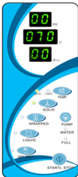
Control Panel (BioClave 16)