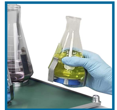
MAGic Clamp Platform H1000-MR with Adjustable MAGIC Clamp (H1000-MR-CMB)