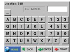
Alphanumeric Location Labels