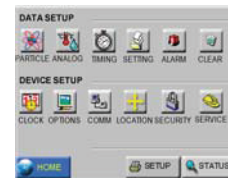
User Friendly Configuration