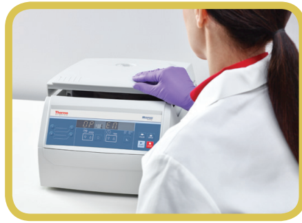
Fast one-click centrifuge lid closure