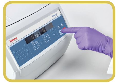
Large, brightly-lit display with intuitive controls