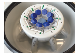
DualSpin rotor with fixed angle buckets