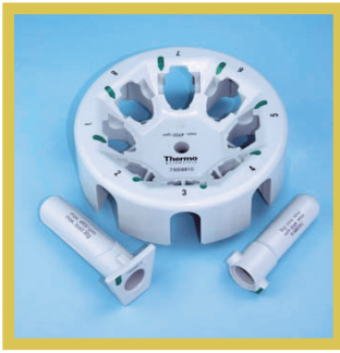
Unique DualSpin rotor with hybrid design