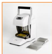
VTS Variable Temperature Sealer V902001