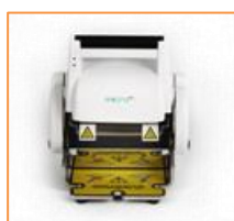
Micro TS Microplate Heat Sealer V903001