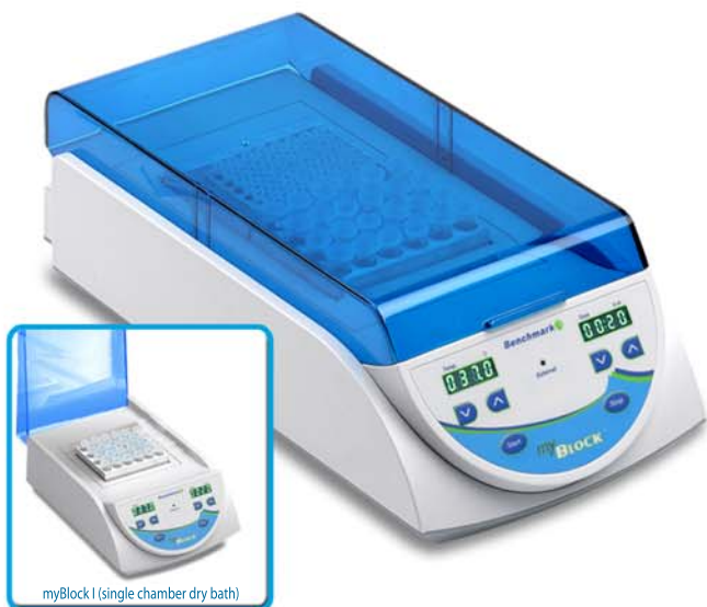
myBlock I (single chamber dry bath)

Benchmark's myBlock series is a "next generation" product line that introduces several major advantages over traditional dry baths. They are the first digital dry baths to include advanced microprocessor controls, timed or continuous operation and a removable hinged lid. In addition, an optional external temperature feedback probe can be positioned directly inside a sample tube, providing real-time control and monitoring of actual sample temperature .