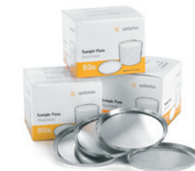
Disposable sample pans

* DAkkS = German accreditation body recognized throughout Europe