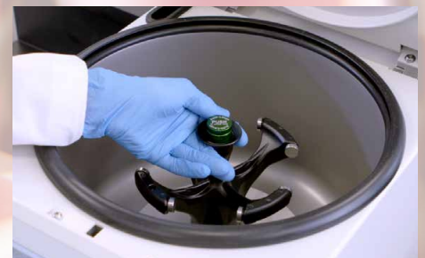
Auto-Lock rotor exchange