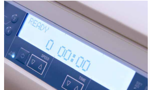
Large brightly-lit displays