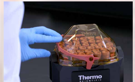
ClickSeal biocontainment lids