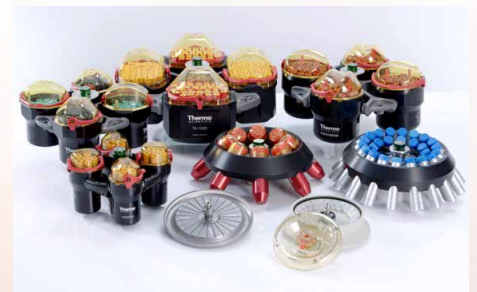
Comprehensive rotor portfolio