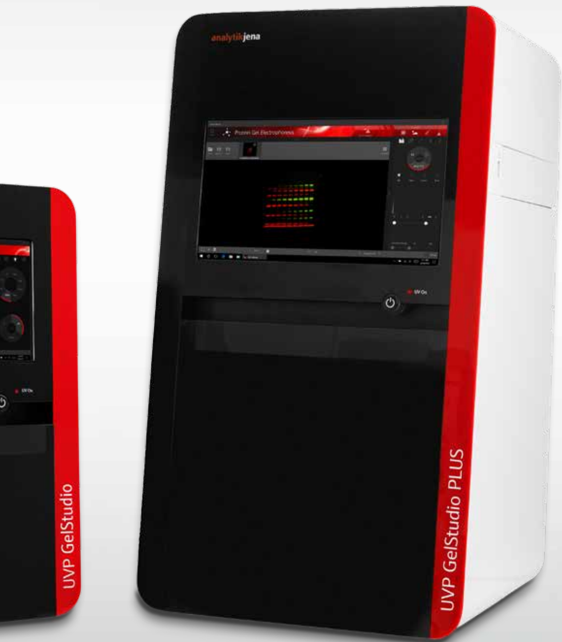
UVP GelStudio PLUS