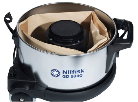
Durable steel container and 15 litre dust bag