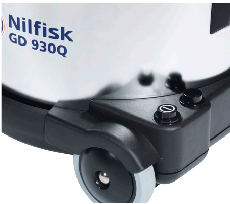
Dual speed function